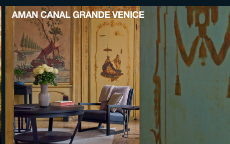
AMAN CANAL GRANDE VENICE

South of Panama's western coast, private resort Isla Palenque forms part of a jigsaw of volcanic islands swaddled by the Gulf of Chiriqui's shimmering waters. Hardwood floors and chaise longues meet canvas walls and cascading outdoor showers in the 'tented suites', which will delight both eco warriors and comfort seekers. With coconut groves and jungle canopy blanketing the land, you'll feel the thrill of exploration as you navigate the jumble of lime green. Find your way to Eden, the main restaurant, to discover delicious local specialities, such as cheese-stuffed yuca fritters and plantains caramelised in cinnamon ( amble.com ).